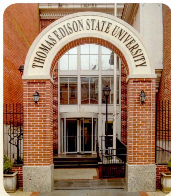
The University's new brick and stone archway that welcomes University staff, students and visitors to the Institution's Kelsey Complex, which was completed in March.

With the addition of this signage, including a stark black background and contrast bronze lettering, the institution is not easily missed driving down Barrack or West State streets.