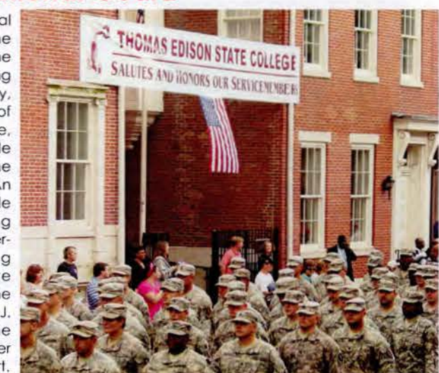
Capital Campus • August 2009 • Page 3

The New Jersey National Guard had a Welcome Home Ceremony on June 12 for 2,800 soldiers returning from Iraq. The ceremony, which took place in front of the New Jersey State House, was followed by a parade that marched to the Sovereign Bank Arena. An estimated 15,000 people lined the street waving American flags and cheering the troops, including Thomas Edison State College staff. To honor the men and women of the N.J. National Guard, College draped a banner over its entrance in support.