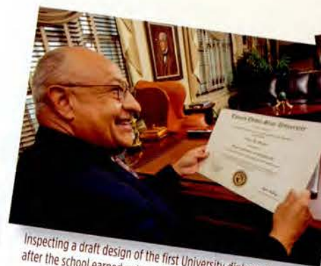
Inspecting a draft design of the first University diploma shortly after the school earned university status in 2015.