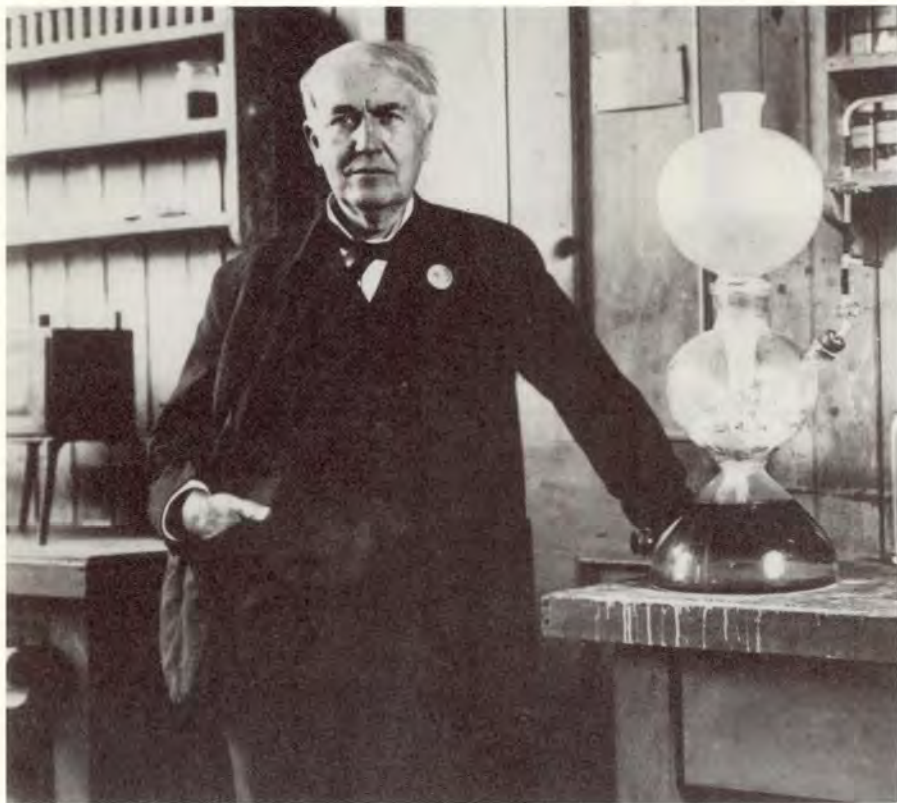
U.S. Department of the Interior, National Park Service, Edison Historical Site