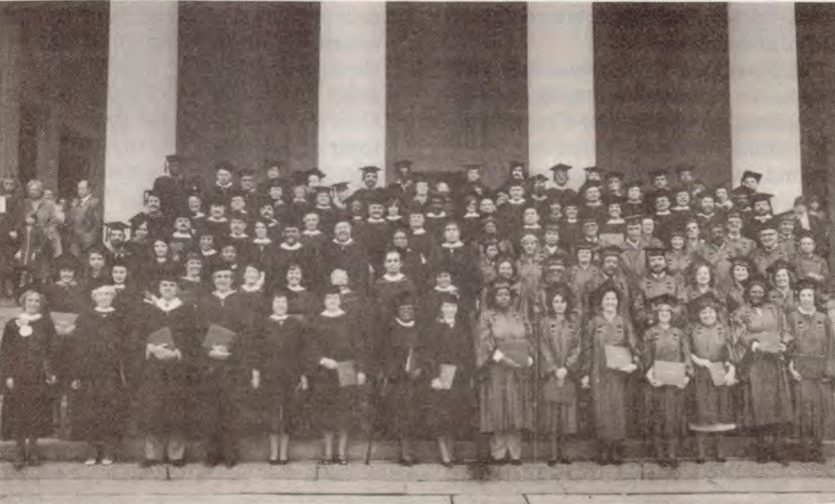
If you attended Commencement in November and would like to purchase a photograph of the group in front of the War Memorial, as seen above, you may write to the Director of Public Relations at the College.

The College has recently revised its formal appeal policy. Under this policy, all appeals should be made in writing to the Registrar. The Registrar will then forward the appeal with all supporting documentation to the appropriate office for review. Once the appeal has been reviewed, the Registrar will notify the student of the outcome. In the case of a denial, the notification will inform the student that the next level for appeal would be the Vice President for Academic Affairs. This appeal must be in writing and should contain all appropriate information and/or documentation.