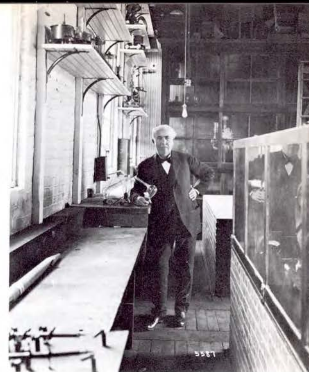
"The inspiration point is the perspiration point." — Thomas A. Edison