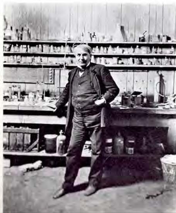
"Without imagination man is a mere animal." — Thomas A. Edison

Today, in New Jersey and across the country, there are many thousands of men and women who possess college-level knowledge but who lack the college credentials necessary for advancement in their careers or in their formal education. Appropriately named after the great inventor and prominent resident of New Jersey, Thomas A. Edison College was created for the express purpose of serving these men and women.