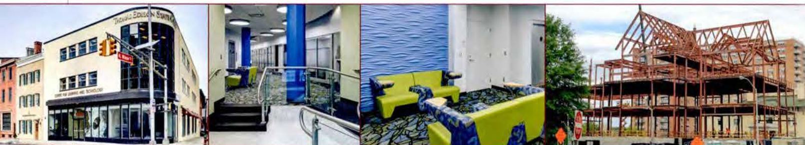
(from left) Exterior of the Center for Learning and Technology; lobby and meeting space in the center; structural steel frame of the Nursing Education Center.

Construction on the College's Nursing Education Center, which is transforming the blighted Glen Cairn Arms site at Calhoun and West State streets in Trenton, is well underway. Crews have completed the concrete foundation