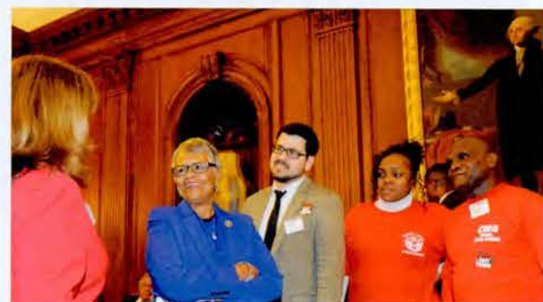
U.S. Rep. Bonnie Watson Coleman meets with constituents in her Washington, D.C., office.

When her father was elected to office, he would often call upon his daughter to write his speeches. Although some were never used, he would garner and share her ideas and visions, which helped to build a foundation of experience and empowerment onto which she would begin to stand.