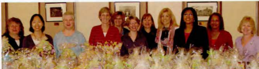
AFT Local 4277 thanks everyone for their donations and participation in the Easter basket project for Children's Home Society of New Jersey. Forty-four treat-filled baskets were provided for local foster families and children.