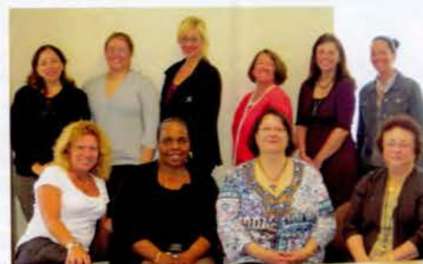
Pictured at left are some of the participants of the newly implemented Thomas Edison State College/New Jersey State Library Weight Watcher's At Work program. Together, 38 employees have lost more than 364 pounds in 11 weeks! All are welcome to join, if interested please contact Office of Human Resources.