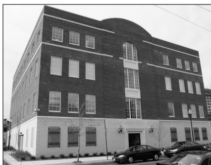
CANAL BANKS BUILDING