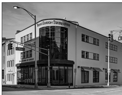
CENTER FOR LEARNING AND TECHNOLOGY