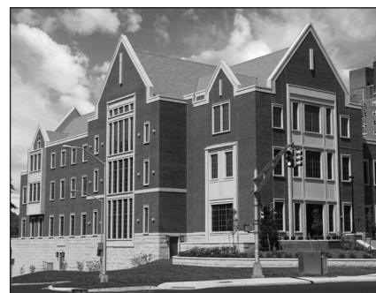
GLEN CAIRN HALL