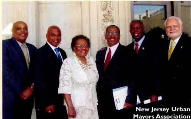
New Jersey Urban Mayors Association