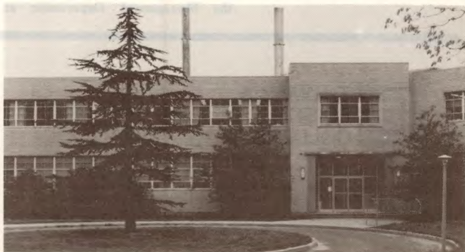
Thomas A. Edison College - located in The Forrestal Center Campus of Princeton University since the spring of 1976, will soon be moving to a central location in Trenton. (See front page for new address and telephone number.)