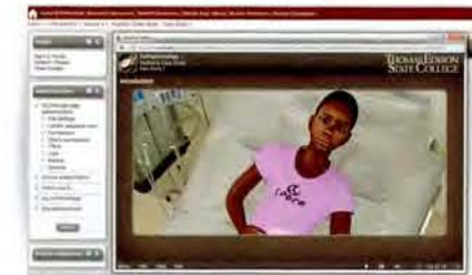
Screen shot of a virtual patient describing her symptoms in a Virtual Clinical Simulation course.

The Thomas Edison State University Foundation was awarded a $5,794 grant by the PNC Foundation in support of the W. Cary Edwards School of Nursing's Virtual Clinical Simulation Program (VCS). This is the third year in a row PNC Foundation has supported the program. The grant supports the expansion of the state-of-the-science platform and plays a critical role in the curriculum for students enrolled in the Accelerated 2nd Degree BSN Program as well as nursing bachelor's and master's programs.