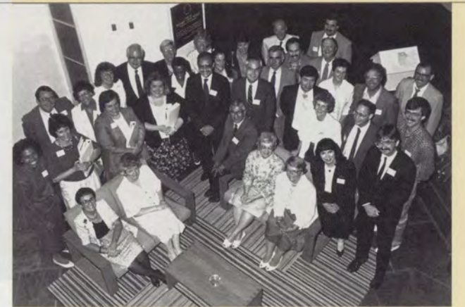
Group shot of attendees and presenters of the first National Institute event held in 1989 at the Henry Chauncey Conference Center in Princeton, N.J.

"Higher education is a public benefit and we have an obligation to the field to make sure prior learning assessment is practiced properly and benefits the learners who possess the type of knowledge this process validates."