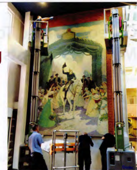
Final adjustments are made as N.C. Wyeth's famous mural of George Washington visiting Trenton is lifted into place in the great hall of Thomas Edison State College's Kelsey Building in Trenton.

"We are honored to house this historic work of art and continue to make it available to residents and visitors of Trenton and Mercer County," said