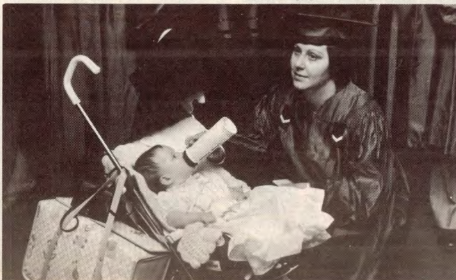
An Edison graduate attends to last minute details prior to the ceremonies.