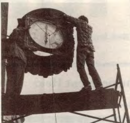
Workmen replace the clock on the front of The Kelsey Building.

We're moved. We're unpacked . . . and we're here to stay . . .