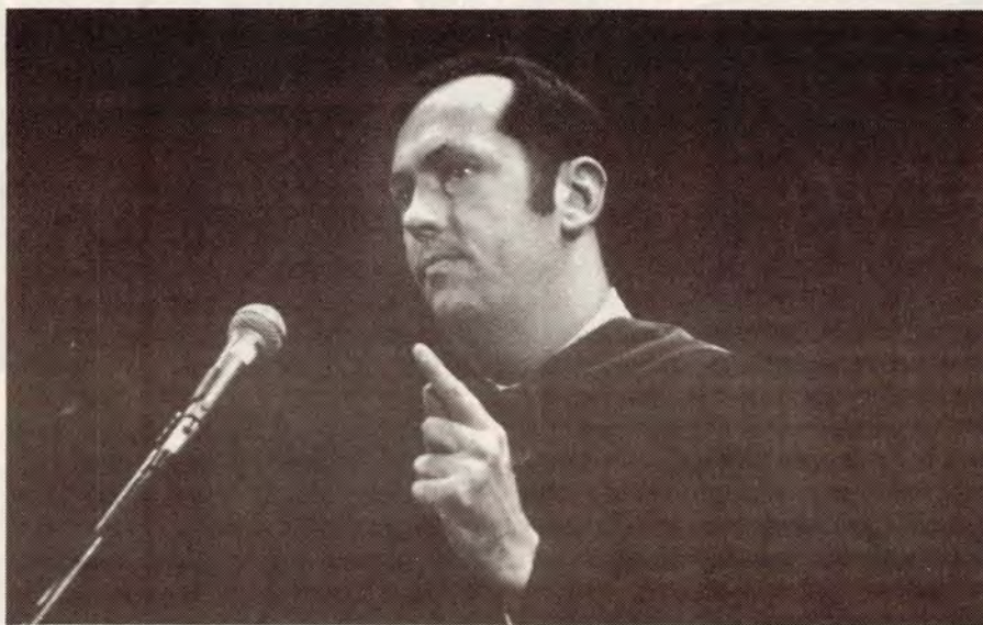
Senator Bill Bradley emphasizes a point during his commencement address.